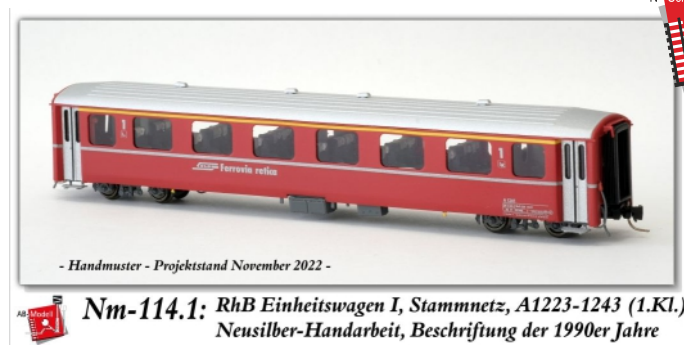
- Handmuster - Projektstand November 2022 -