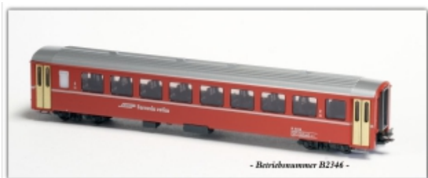
PI-9230.Nm: RhB 2.Kl. EW I, rot, goldene Türen, Nm (6,5mm), Kato-Kurzkuppl., Pirata-Modell, Basis Kato EW I