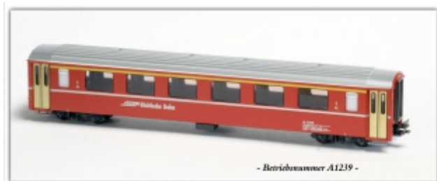
PI-9231.N: RhB 1.Kl. EW I, rot, goldene Türen, Spur N (9 mm), Kato-Kurzkuppl., Pirata-Modell, Basis Kato EW I

Pirata model based on Kato, 2nd class B2346 Standard coach I, red, golden doors, silver trim line Plastic model, scale 1:150, N-gauge Optionally available converted to N narrow gauge