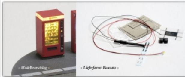
Nm-Y00321: Selecta Warenautomat, Ätz-/3D-Druck-Bausatz, 1 St., mit LED-Beleuchtung, Spuren Nm oder N

Typical vending machine, as can be found at almost all railway stations in Switzerland Kit, including LED lighting Can be used for both N and Nm