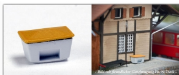
Nm-Y00312: Salz-/Streugut-Behälter, fertig lackiert, 2 Stück, 3D-Druckteile, Spuren Nm oder N

Salt/gravel container created using 3D printing Two finished models in a set Can be used for both N and Nm