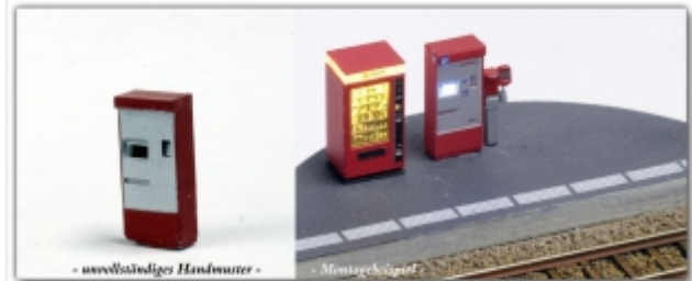
Nm-Y00322: RhB Fahrkartenautomat, fertig lackiert, beleuchtet, 3D-Druckteil, Spuren Nm oder N

Rhaetian Railway ticket machine, as can be found at every RhB railway station Detailed finished model with LED lighting Can be used for both N and Nm