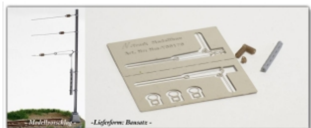
Nm-Y00170: Spannwerk, mit Gewichtsattrappe, finescale für H-Profilmasten 1,5x1,5mm, 1 St., Bausatz

Wheel tensioning device, incl. insulators and dummy weight Finescale kit for 1.5x1.5mm H-profile masts Can be used for both N and Nm