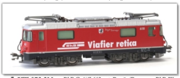
KT-073.2N: RhB Ge4/4" 618, rot, Bergün/Bravuogn, RhB-Werbung, Kato-Modell für Spur N (9mm)

Express locomotive Ge4/4II 618, red, Bergün coat of arms Model with large RhB advertising Kato close coupling (standard N-coupling included)