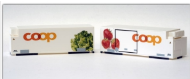
KT-014.2: Kühlwechselbehälterset Coop Erdbeere und Salat, Kato-Modelle, Maßstab 1:150, für N und Nm

two Coop exchangeable refrigerated containers strawberry and lettuce motifs for loading the vehicles models in scale 1:150, for N and Nm