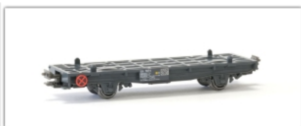
KT-014.1Nm: RhB Lb-v 7874, unbeladen, Spur Nm (6,5mm), ungespurtes Kato-Modell, mit Kato-Kurzkupplung

two-axle carrying wagon Lb-v 7874, unloaded model with Kato close coupling (N-coupling enclosed)