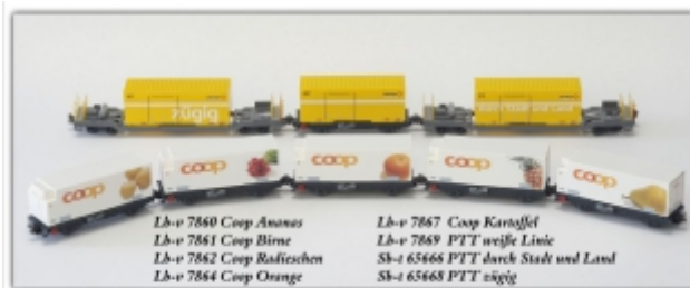
KT-014.0Nm: RhB 8-tlg. Güterwagenset m. 6x2- u. 2x4-achsigen Tragwagen, beladen, Spur Nm (6,5mm), Kato-M.

8-piece freight wagon set container wagons contains 6 two-axle Lb-v and 2 four-axle Sb-t with 5 refrigerator swaps of the Coop + 3 swaps of the Post equipped with Kato close coupling (N-coupling enclosed)