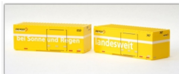
KT-014.3: Wechselbehälterset PTT „747 landesweit“, „850 bei Sonne und Regen“, Kato-Modelle, Maßstab 1:150, für N / Nm

two Swiss Post swap bodies motifs „landesweit“ and „bei Sonne und Regen“ for loading the vehicles models in scale 1:150, for N and Nm