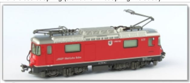
KT-070.1Nm: Ge4/4" 631, rot, Wappen Untervaz, umgespurt auf Nm von AB-Modell (Basis Kato)

Express locomotive Ge4/4II 631, red, Untervaz coat of arms New edition of the well-known N locomotive Kato close coupling (standard N-coupling included)