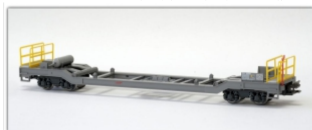
KT-015.1N: RhB Sb-t 65658, unbeladen, Spur N (9mm), Kato-Modell, mit Kato-Kurzkupplung

four-axle low-floor carrier Sb-t 65658, unloaded model with Kato close coupling (N-coupling included))