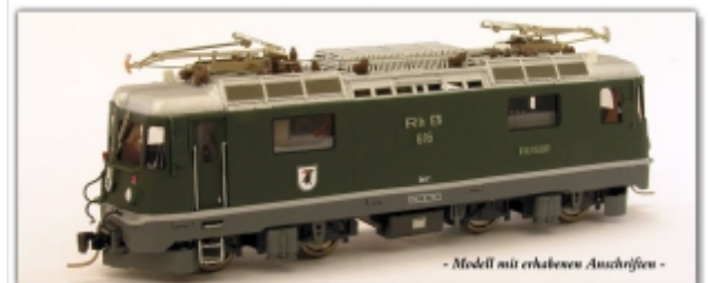
Nm-232.1: RhB Ge4/4" 616, grün, Wappen Filisur, Handarbeitsmodell, Faulhaber motor, Schwungmasse, Decoder

Vorbehaltlich Lieferbarkeit und Preisänderungen durch N-Track