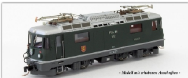
Nm-231.1: RhB Ge4/4" 612, grün, Wappen Thusis, Handarbeitsmodell, Faulhaber motor, Schwungmasse, Decoder