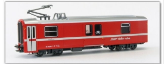
KT-013.1Nm: RhB - vierachsiger Gepäckwagen mit großem Tor, DS 4223, Kato-Modell umgespurt auf Nm 6,5mm

Luggage car with large central door on each side of the wagon modern version with pantograph (heating car) Kato model converted to Nm gauge (6.5mm), scale 1:150 equipped with close coupling