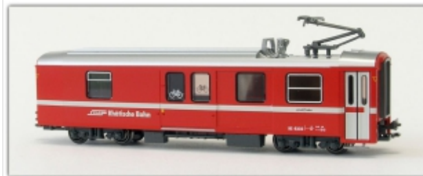
KT-013.1N: RhB - vierachsiger Gepäckwagen mit großem Tor, DS 4223, Kato-Modell für Spur N

Luggage car with large central door on each side of the wagon modern version with pantograph (heating car) Kato model for N gauge (9mm), scale 1:150 equipped with close coupling, standard coupling enclosed