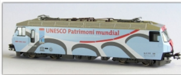
KT-005.31N: RhB Ge4/4 III 650 UNESCO-Welterbe, Sonderserie Kato, Einzellok, Spur N, Standardkupplung

Single locomotive, unchanged from the first set light blue advertising loco for the UNESCO World Heritage Kato model for N gauge (9mm), scale 1:150 equipped with close coupling, standard coupling is included