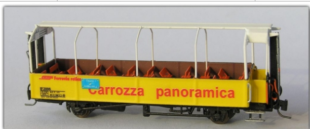
Nm-107.1: RhB - zweiachsiger, offener Aussichtswagen, B 2 2096 ff.

Track Nm = 6,5 mm MTL-couplers Chassis from metal Newsilver-item Browned wheelsets, pointed Easy rolling Detailed brakeshoes The following roadnumbers will be produced B 2 2096, 2097, 2099, 2102 With or without "blue-board" (four destinations Tirano, Poschiavo, St. Moritz, Reserviert) Minimumradius 195 mm Weight approx. 11,0 g To be delivered from: Q.III/2015