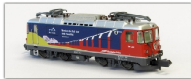
MD-60011.N: RhB Ge4/4" 620, RhB-Club, Spur N (9 mm), mit Rapidokupplung, MDS-Modell