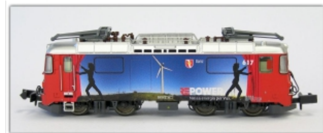
MD-60009.N: RhB Ge4/4" 617, RE-Power Sommer, Spur N (9 mm), mit Rapidokupplung, MDS-Modell

Available now are the Ge4/4II 615 with winter motif and the Ge4/4II 617 with summer motif. While the winter picture has been advertising RE-Power without interruption since 2010, the summer picture 2018 had to make space for the LGB advertising. Both motifs are pin sharply applied and a real feast for the eyes. Also the lettering on the front was not forgotten.