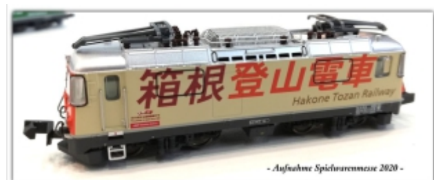
MD-60012.N: RhB Ge4/4" 622, Hakone Tozan Railway, Spur N (9 mm), mit Rapidokupplung, MDS-Modell

Ge4/4II 620 advertising „RhB-Club“ with Faulhaber-type armature motor, fine etched parts available analogue, digital and with sound N gauge (9mm) with N standard coupling