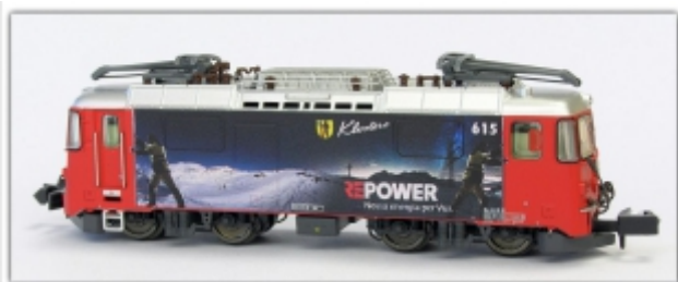
MD-60008.N: RhB Ge4/4" 615, RE-Power Winter, Spur N (9 mm), mit Rapidokupplung, MDS-Modell

The advertising locomotives of the company RE-Power (until 2010 Rätia Energie AG) have become real eye-catchers. The two red machines show different motives from winter and summer on the side walls. They advertise with the slogan "Unsere Energie für Sie" or in Rhaeto-Romanic "Nossa energia per Vus" ("Our energy for you").