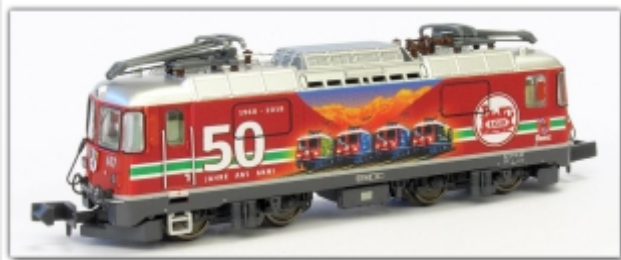
MD-60006.N: RhB Ge4/4" 617, 50 Jahre LGB, Spur N (9 mm), mit Rapidokupplung, MDS-Modell

Ge4/4II 617 advertising „50 Jahre LGB“ with Faulhaber-type armature motor, fine etched parts available analogue, digital and with sound N gauge (9mm) with N standard coupling