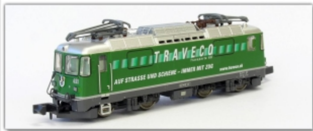
MD-60010.N: RhB Ge4/4" 621, Traveco, Spur N (9 mm), mit Rapidokupplung, MDS-Modell

Ge4/4II 621 advertising „TRAVECO“ with Faulhaber-type armature motor, fine etched parts available analogue, digital and with sound N gauge (9mm) with N standard coupling