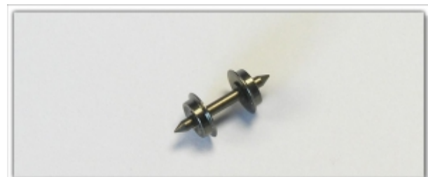
MD-61000.10: Tauschradsatz für MDS-Güterwagen, 1 Stück, zur Umspurung auf 6,5mm (N-Schmalspur)

Please note that the smaller diameter leads to a slightly lower position of the coupling. We therefore recommend equipping the locomotive with the wagon coupler in order to minimize the difference.