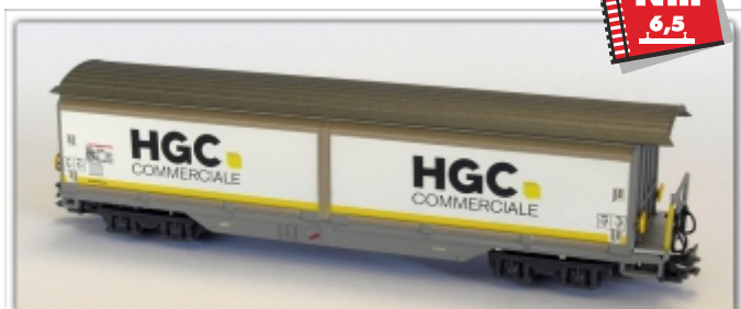
MD-61003.Nm: RhB Schiebewandwagen Haik-v 5134 HG Commerciale, Spur Nm (6,5mm), Basis MDS