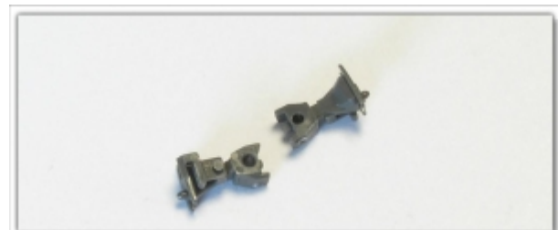
KT-096.6: Kato-Kurzkupplungsset für Personen- und Güterwagen, 2 Stück im Set

On our test system, the models drove through the minimum radius of 150mm even with the short coupling without problems. We recommend radii from 195mm (Marklin Z - R2)!