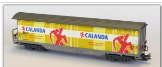
MD-61004.Nm: RhB Schiebewandwagen Haikqq-y 5170 Calanda Bräu, Spur Nm (6,5mm), Basis MDS-Modell

Sliding door wagon with advertising of HG Commerciale white sliding doors with elaborate printing yellow hand wheels