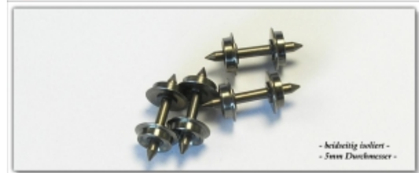
MD-61000.11: Tauschradsätze für MDS-Güterwagen, 4 Stück, zur Umspurung auf 6,5mm (N-Schmalspur)