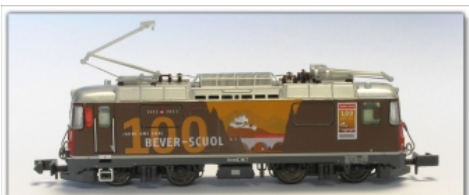
MD-60004.N: RhB Ge4/4" 620, 100 Jahre Engadin, Spur N (9 mm), mit Rapidokupplung, MDS-Modell

Ge4/4II 630 - Trun green with red fronts, prototypically printed on 100th birthday of the Rhine-valley line Chur - Disentis