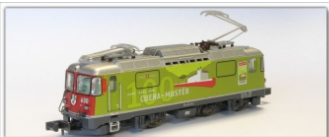
MD-60003.N: RhB Ge4/4" 630, 100 Jahre Rheintal, Spur N (9 mm), mit Rapidokupplung, MDS-Modell

Ge4/4II 619 - Samedan dark blue with red fronts, prototypically printed on 100th birthday of the Bernina line