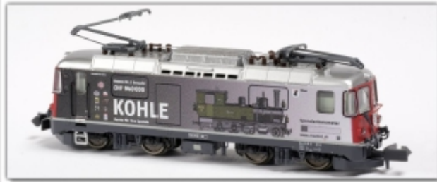
MD-60005.N: RhB Ge4/4" 616, Spendenlok „Rhätia“, Spur N (9 mm), mit Rapidokupplung, MDS-Modell

Rhaetian Railway universal locomotive Ge4/4" 616 Advertising motif 'Rhätia' N gauge (9mm) with N standard coupler