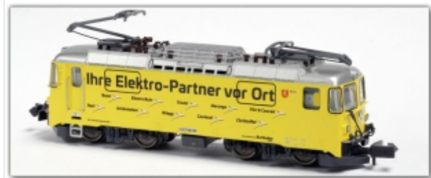
MD-60014.N: RhB Ge4/4" 612 gelb, Werbemod. Burkhalter-Gruppe, Spur N (9 mm), N-Kupplung, MDS-Modell

Rhaetian Railway universal locomotive Ge4/4" 618 Advertising motif 'edelweiss' N gauge (9mm) with N standard coupler