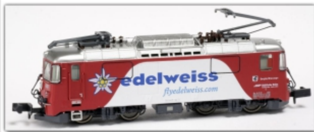
MD-60013.N: RhB Ge4/4" 618 rot, Werbemodell „fly edelweiss“, Spur N (9 mm), mit Rapidokupplung, MDS-Modell

The adjacent advertising locomotive promotes the fund-raising campaign for the re-commissioning of the first steam locomotive of the Rhaetian Railway G3/4 No. 1 'Rhätia'. Every model sold will contribute EUR 5 to the historic RhB's donation fund, which will be used directly for the preservation and recommissioning of these historically valuable treasures.