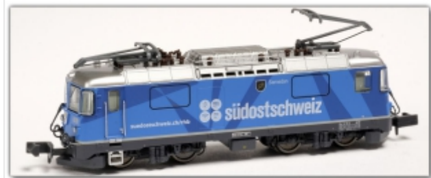
MD-60015.N: RhB Ge4/4" 619 blau, Werbemod. Südostschweiz, Spur N (9 mm), N-Kupplung, MDS-Modell

Digitised models and digital locomotives with sound are also available ex works. Digital drivers should order a digitalised or sound locomotive directly from us, as we do not carry out digital conversions and installations in our workshop.