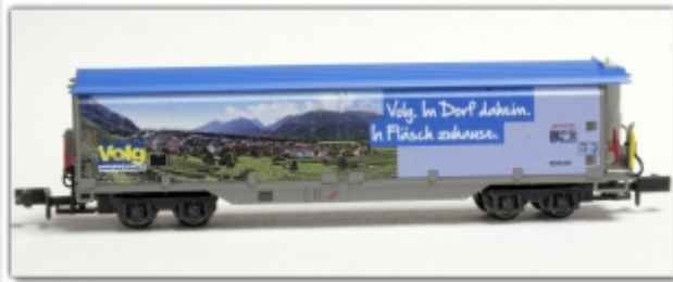
MD-61010.N: RhB Schiebewandwagen Haiqq-tuыз5174 Volg Motif Fläsch, Spur N, MDS-Modell

Sliding wall carriage Haiqq-tuыз 5174 VOLG 'VOLG. At home in the village.' Motif Fläsch N gauge (9mm) with N standard coupler or optionally Nm gauge (6.5 mm) with a Kato close coupler