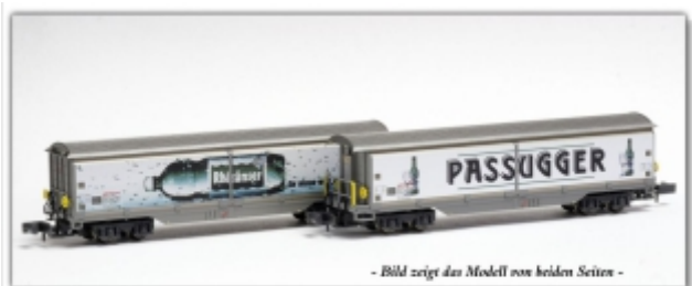
- Bild zeigt das Modell von beiden Seiten -

Sliding wall carriage Haik-qy 5168 with advertising for Rhäzünser/Passugger (one wagon, two different side adverts) N gauge (9mm) with N standard coupler or optionally Nm gauge (6.5mm) with Kato close coupler