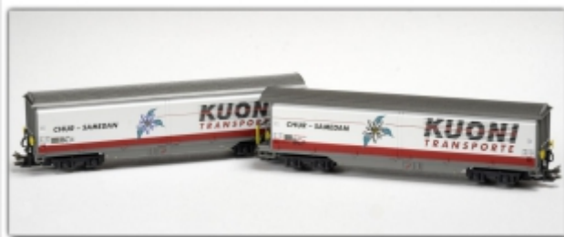
MD-61013.Nm: RhB Wagenset: Haiq-v5132 Kuoni und Haiq-v5133 Kuoni, Spur Nm, MDS-Modell

Sliding wall carriage Haiq-v 5128 „Möbel Pfister“ N gauge (9mm) with N standard coupler or optionally Nm gauge (6.5 mm) with a Kato close coupler