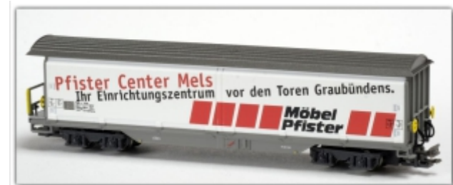
MD-61012.Nm: RhB Schiebewandwagen Haiq-v5128 Möbel Pfister, Spur Nm, MDS-Modell