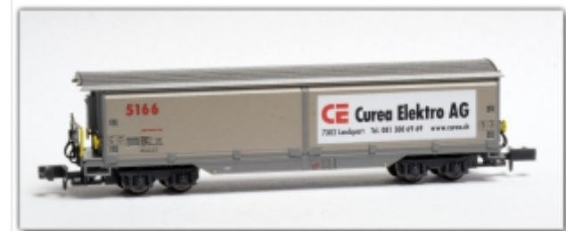
MD-61014.N: RhB Schiebewandwagen Haiqqq-y5166 Curea Elektro, Spur N, MDS-Modell