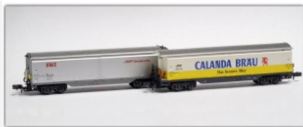
MD-61011.N: RhB Wagenset: Haiq-qv5161 Calanda und Haiqq-y5162 silber, Spur N, MDS-Modell

In addition to the goods wagons, the locomotives are also arriving. We will report on this as soon as they are available.