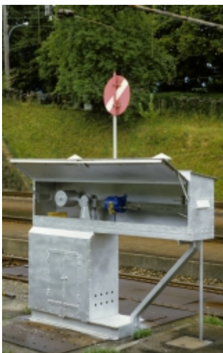
Scale on standard-gauge Swiss Federal railways (station of Meggen, 1986)