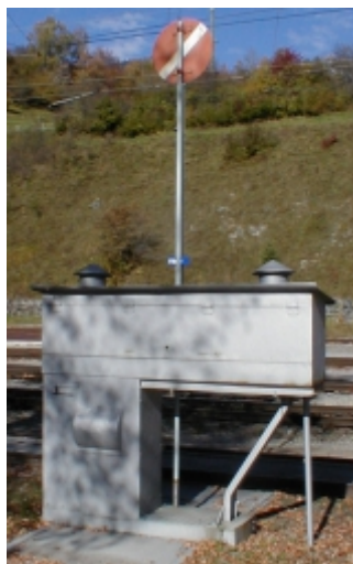
Scale on metre-gauge Rhaetian railway (station of Filisur, 1999)