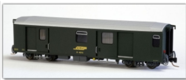
Nm-112.4: RhB vierachsiger Gepäckwagen D4210 - 4213, grün mit gelben Anschriften (1980er), Spur Nm (6,5mm)

Nickel silver handmade model, made in Germany