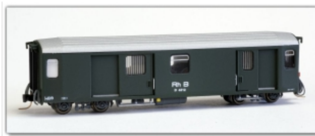
Nm-112.5: RhB vierachsiger Gepäckwagen D4210 - 4213, grün mit weißem RhB-Signet (1970er), Spur Nm (6,5mm)

Nickel silver handmade model, made in Germany