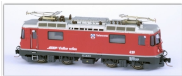
Nm-243.1: RhB Ge4/4" 629, rot, Wappen Tiefencastel, Handarbeitsmodell, Faulhabermotor, Schwungmasse, Decoder

Nickel silver handmade model of the RhB loco Ge4/4II. Red version with dark grey apron, RhB logo and lettering Municipal coat of arms Reichenau-Tamins Model with round headlights