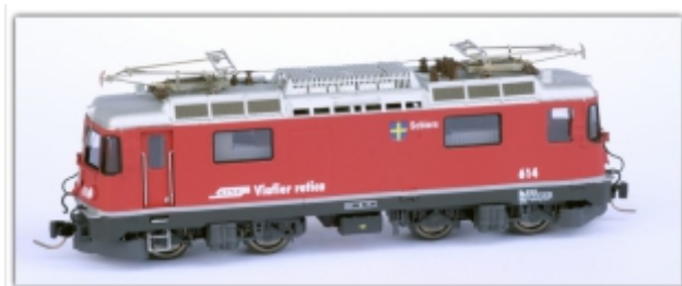
Nm-244.1: RhB Ge4/4" 614, rot, Wappen Schiers, Handarbeitsmodell, Faulhabermotor, Schwungmasse, Decoder

Nickel silver handmade model of the RhB loco Ge4/4II. Red version with dark grey apron, RhB logo and lettering Municipal coat of arms Tiefencastel Model with round headlights