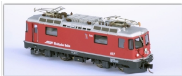
Nm-241.1: RhB Ge4/4" 617, rot, Wappen Ilanz, Handarbeitsmodell, Faulhabermotor, Schwungmasse, Decoder

The RhB's Ge4/4II, which looks similar to the SBB Re4/4II, is often referred to as a Bonsai locomotive.