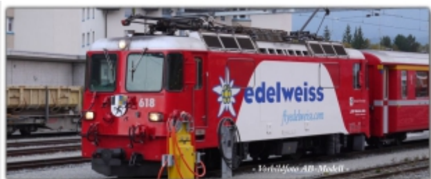
MD-60013.N: RhB Ge4/4" 618 rot, Werbemodell „fly edelweiss“, Spur N (9 mm), mit Rapidokupplung, MDS-Modell

Express locomotive Ge4/4II 618, red with advertising motif "fly edelweiss" N-model with standard N-coupling