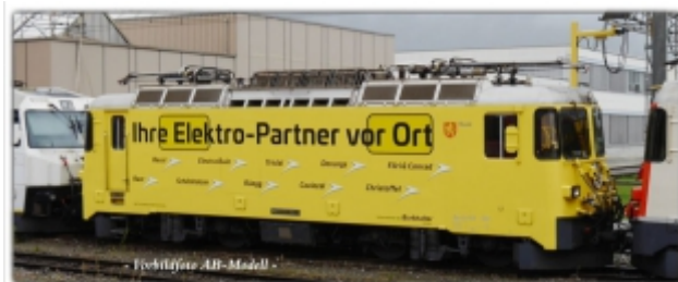
MD-60014.N: RhB Ge4/4" 612 gelb, Werbemod. Burkhalter-Gruppe, Spur N (9 mm), N-Kupplung, MDS-Modell

Express locomotive Ge4/4II 612, yellow Advertising model of the Burkhalter Group N-model with standard N-coupling