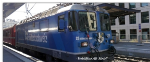
MD-60015.N: RhB Ge4/4" 619 blau, Werbemod. Südostschweiz, Spur N (9 mm), N-Kupplung, MDS-Modell

Express locomotive Ge4/4II 619, blue Advertising model Südostschweiz N-model with standard N-coupling