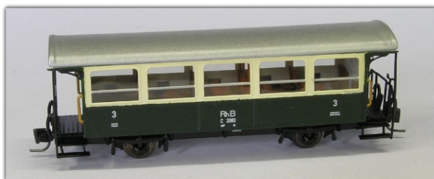
Nm-104.3: RhB Zweiachser der ehemaligen Berninabahn C 2081 ff.