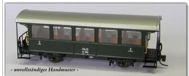
Nm-104.4: RhB Zweiachser der ehemaligen Berninabahn B 2 2081 ff.