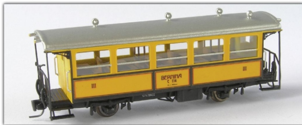
Nm-104.1: RhB historischer Zweiachser der Berninabahn C114