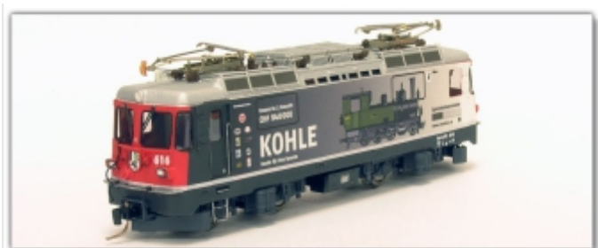
Nm-222.2: RhB Ge4/4" 616 Filisur, Spendenlok „Rhätia“, Neusilber-Handarbeitsmodell, Faulhaber motor