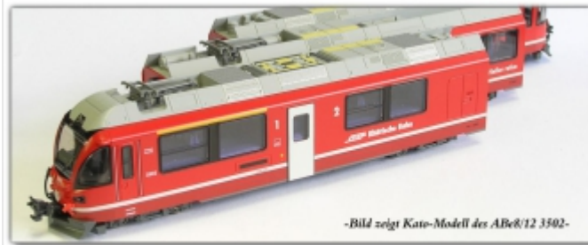
-Bild zeigt Kato-Modell des ABe8/12 3502-

Available as standard as N gauge model, we also offer it as a narrow-gauge vehicle