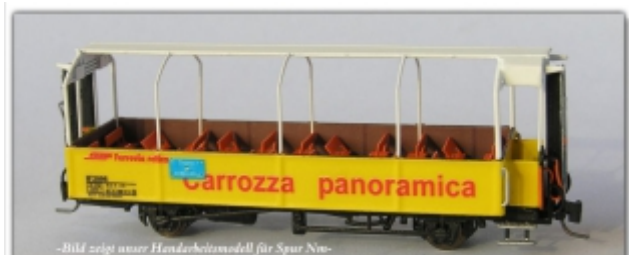
-Bild zeigt unser Handarbeitsmodell für Spur Nm-

Occasionally the trains are given open panorama coaches, which offer a special travel experience in the fresh air. The open observation cars are also used in the Rail-Rider (Albula Valley) or in the Rhine Gorge and can run on the Bernina Line as well as on the entire main network. For the model railway enthusiast they are a welcome addition to the rolling stock park, and can even be found in goods trains when the vehicles are moved from one place of operation to another.