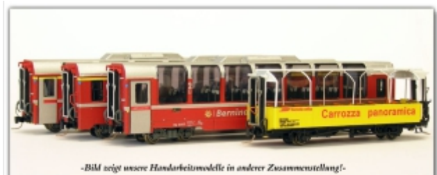
-Bild zeigt unsere Handarbeitsmodelle in anderer Zusammenstellung-

gauge N, optionally also available for Nm