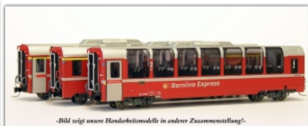
-Bild zeigt unsere Handarbeitsmodelle in anderer Zusammenstellung-

KT-009.4N: RhB Bernina Express-Set mit 3 Panoramawagen 1xA 2xB, Spur N (9mm), Kato-Modell