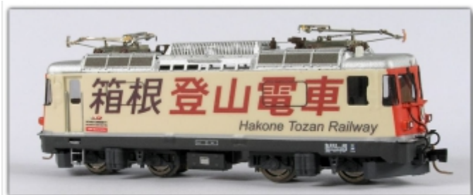
Nm-224.2: RhB Ge4/4" 622, creme/rot-orange, Hakone Tozan Ry., Handarbeitsmodell, Faulhaber, Schwungmasse, Decoder