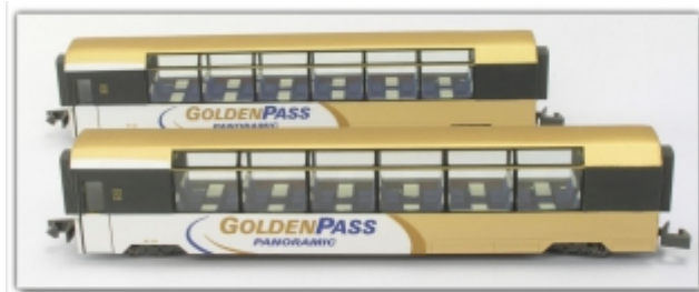
KT-021.6N: MOB Montreux-Oberland-Bahn Zwei-Wagen-Set Golden Pass Panoramic (As/Bs), Spur N (9mm)

The GoldenPass Panoramic-Express lives up to its name and has received a golden paint finish from us.