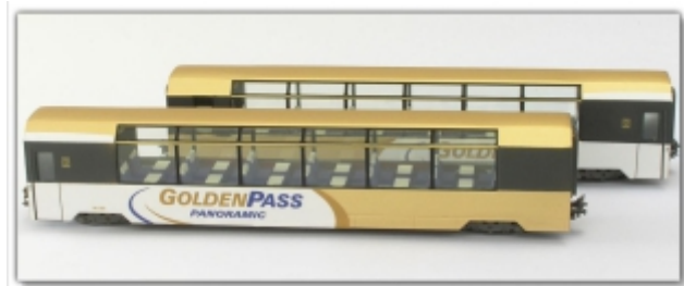
KT-021.7Nm: MOB Montreux-Oberland-Bahn Zwei-Wagen-Set Golden Pass Panoramic (Bs/Bs), Spur Nm (6,5mm)

Art.-Nr./item-no./produit-no. redecorated panorama car based on the Kato Glacier Express models two-car set with As114 and Bs251 available in: standard gauge N (9mm) with standard N-coupling narrow gauge Nm (6.5mm) with Kato close coupler