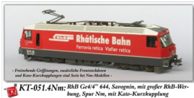
KT-051.4Nm: RhB Ge4/4''' 644, Savognin, mit großer RhB-Werbung, Spur Nm, mit Kato-Kurzkupplung

Two almost identical vehicles advertise the RhB in large letters on their side walls: Ge4/4III 644 Savognin and Ge4/4III 647 Grüşch.