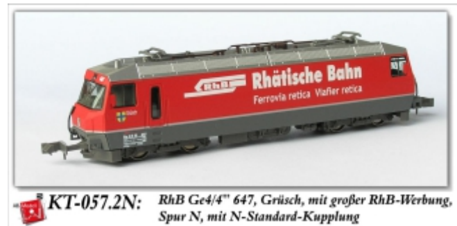
KT-057.2N: RhB Ge4/4''' 647, Grüşch, mit großer RhB-Werbung, Spur N, mit N-Standard-Kupplung

Kato model of the RhB Ge4/4III 644 painting red, with municipal coat of arms Savognin circumferential, medium grey apron double-sided RhB sidewall advertising all axles driven, two wheel sets with traction tires plastic pantographs, without function Kato motor with obliquely grooved anchor, flywheel mass