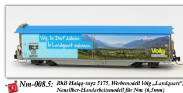
Nm-008.5: RhB Haiqq-tuыз 5175, Werbemodell Volg „Landquart“, Neusilber-Handarbeitsmodell für Nm (6,5mm)

motif: „Volg. Im Dorf daheim. In Fläsch zuhause.“