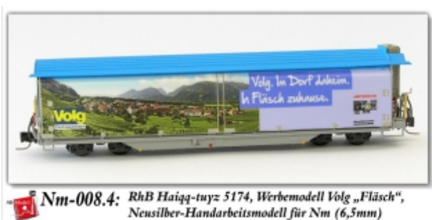
Nm-008.4: RhB Haiqq-tuыз 5174, Werbemodell Volg „Fläsch“, Neusilber-Handarbeitsmodell für Nm (6,5mm)

Detailed rear panel with freestanding handles, mains switch and additional sockets.