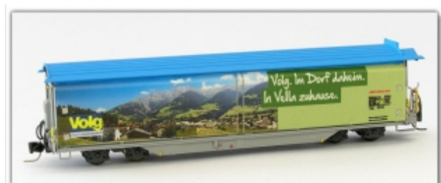
Nm-007.5: RhB Haikqq-uy 5164, Werbemodell Volg „Vella“, Neusilber-Handarbeitsmodell für Nm (6,5mm)

motif: „Volg. Im Dorf daheim. In Ardez zuhause.“