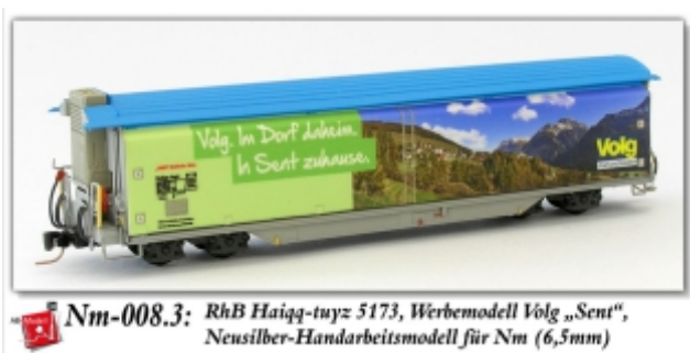
Nm-008.3: RhB Haiqq-tuыз 5173, Werbemodell Volg „Sent“, Neusilber-Handarbeitsmodell für Nm (6,5mm)