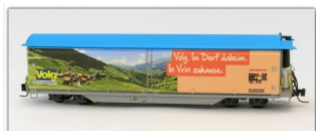
Nm-007.3: RhB Haikqq-uy 5162, Werbemodell Volg „Vrin“, Neusilber-Handarbeitsmodell für Nm (6,5mm)

The two model series differ in some striking details: above the models with modern, large cooling unit and handwheels to open the side walls, ... below the models with the old, still rectangular cooling unit and opening brackets for the side walls. And, additional sockets are fitted to the rear wall.