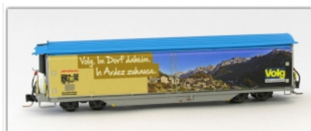
Nm-007.4: RhB Haikqq-uy 5163, Werbemodell Volg „Ardez“, Neusilber-Handarbeitsmodell für Nm (6,5mm)

motif: „Volg. Im Dorf daheim. In Vrin zuhause.“