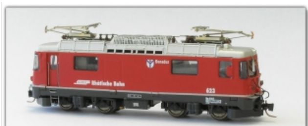
Nm-225.1: RhB Ge4/4" 623 „Bonaduz“, Neusilber-Handarbeitsmodell mit Faulhaber motor und Schwungmasse