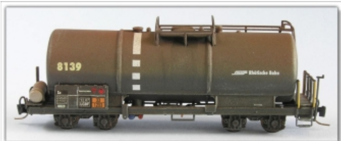
Nm-018.2: RhB Kesselwagen Za 8131 - 8140 Farbgebung grau/rotbraun (mittlere Alterung)