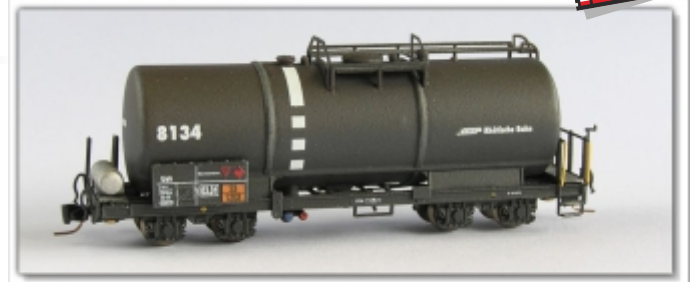
Nm-018.1: RhB Kesselwagen Uah 8131 - 8140 Farbgebung dunkelgrau (leichte Alterung)

Art.-Nr./item-no./produit-no. eight different road-numbers Uah 8131 - 8140 (without 8135 / 8138) painting dark grey weathering light