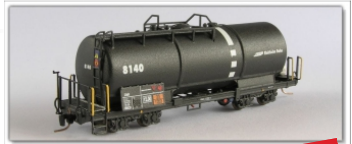
Nm-018.0: RhB Kesselwagen Uah 8131 - 8140 Farbgebung anthrazit (fabrikneu)

Art.-Nr./item-no./produit-no. eight different road-numbers Uah 8131 - 8140 (without 8135 / 8138) painting anthracite grey status as build in 1996 with new oil-tank