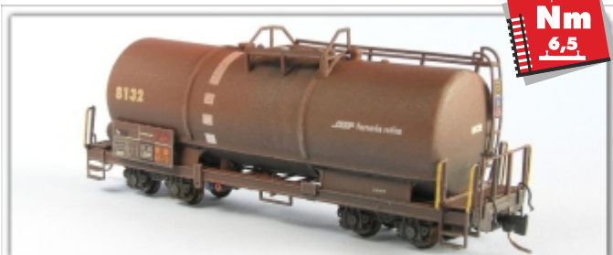
Nm-018.3: RhB Kesselwagen Za 8131 - 8140 Farbgebung grau/rostig (starke Alterung)