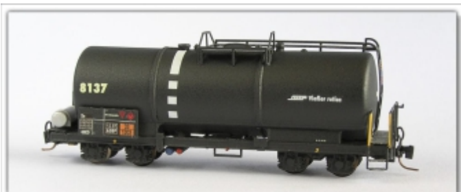
Nm-018.4: RhB Kesselwagen Za 8131 - 8140 Farbgebung anthrazit (fabrikneu)