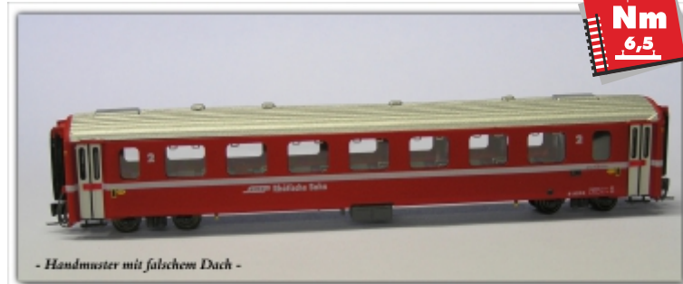
Nm-108.7: RhB Einheitswagen II, Stammnetz, B2374-2450 (2.Kl.), Beschriftung der 2010er Jahre

After 30 years of use all vehicles of the series of standard coaches type II were completely rebuilt. Especially the interior got a complete revision for more comfort for the passengers. This so-called „Refit-action“ is easy to recognize at the roofs, where new hatches for the air-condition are installed. The body was painted new, to refresh the red colour and the lining changed from a small silver line to a wider line in a light grey colour.