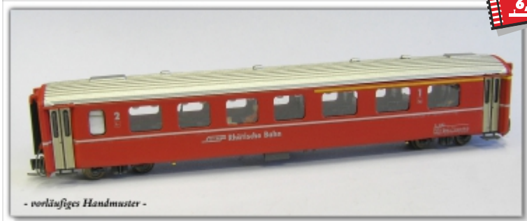
Nm-108.3: RhB Einheitswagen II, Stammnetz, AB1561-1570 (1./2.Kl.), Beschriftung der 1990er Jahre