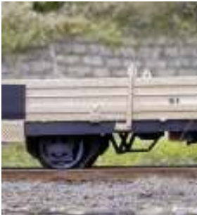
Details from brakes and stakes